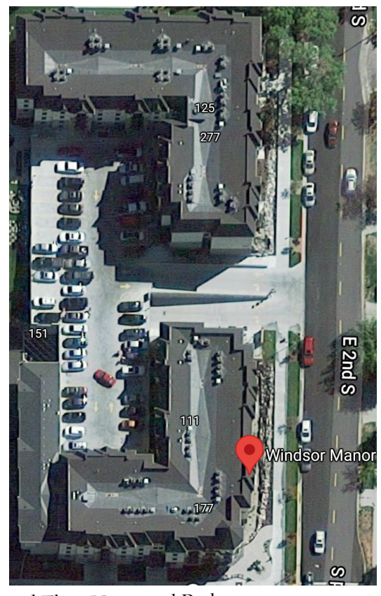
3rd Floor Uncovered Parking